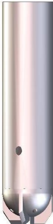
Type "S" Set Shoe

The rounded design of the concrete noses of these Davis shoes assists in guiding the casing string into the hole and safely to the bottom. Both have flat-finished concrete tops to provide strong surfaces for landing cement plugs. The Type 600 (shown) has a single fluid outlet through the nose while the Type 601 (not shown) has down-jets which deliver the efficient washing action, cement slurry distribution and other benefits of the Type 501-PVTS.