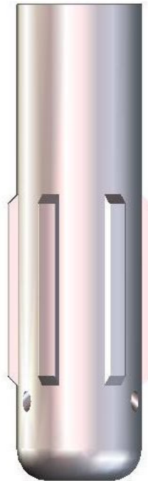
Ribbed Down Jet Float Shoe