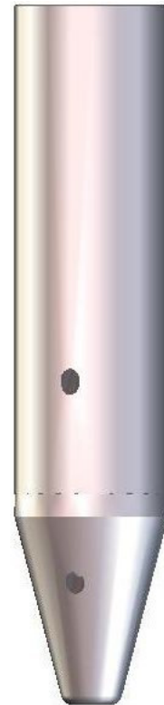
Needle Nose Float Shoe